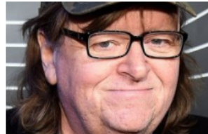
Michael Moore's Warning About How Trump Will 'Get Us Killed'