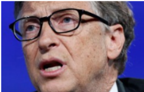
Bill Gates' Bold Statement on Donald Trump