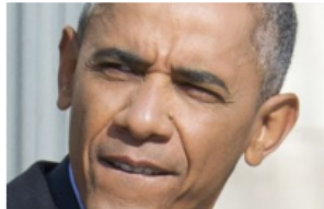
Obama Took Time From His Last Days In Office To Be In A Wedding