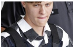
Facing the Needle, Dylann Roof Says 'I Had To Do It'