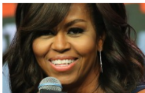
Michelle Obama Talks Helping Melania Trump