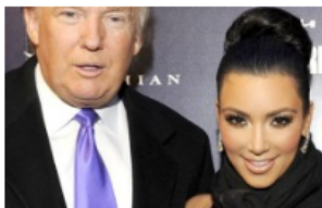
The Time Donald Trump Body-Shamed Kim Kardashian